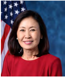
Rep. Michelle P. Steel U.S. Congress District 43

I want to congratulate Love in Music for celebrating your 15th year anniversary! Congratulations on this milestone and thank you for your outstanding service to our community. As an immigrant and one of the first Korean-American women elected in Congress, I believe that it is important to recognize the positive impact this organization has on our Asian American youth. By providing children with